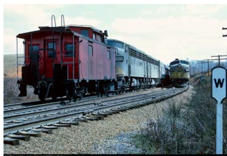
Society's caboose (former CRR #1073) in service near Johnson City, TN.