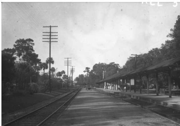
Winter Park is getting its fourth depot this year and most of us don't remember its first or second ones. This circa, 1935 photo shows their second depot, built by the ACL and located on the east side of the tracks where Morse Boulevard crosses today. The depot was accessed via a bricked cul-de-sac off of Park Avenue.