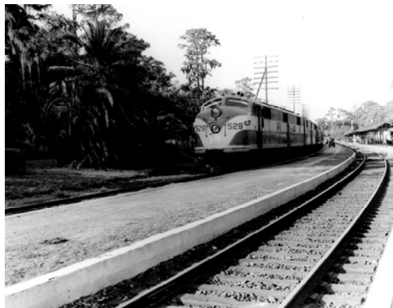
ACL's purple and silver E7A #529, only a year and a half old, with a south bound train, probably the West Coast Champion, has made a stop at Winter Park's second depot on January 8, 1947.