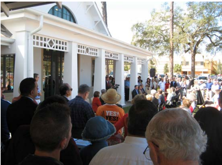
Congressman John Mica, 7 th Congressional District of Florida, is between the center set of columns to the left, addressing the crowd. He seemed almost relieved that this long fought for project was finally becoming a reality.