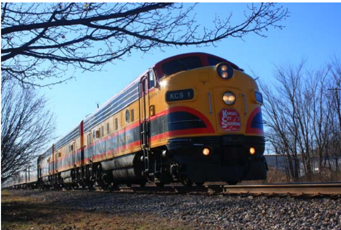
KCS #1 Northbound at Mena AR, 12/10/09, With Holiday Express