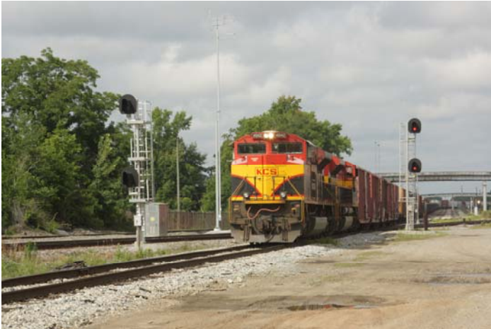
KCS #4042 Eastbound at Meridian Ms. 6/8/12