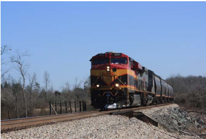
KCS #4691 Southbound at Potter AR, 1/7/10 , With a Grain Train