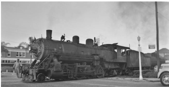
This early 1940s photo finds ACL #807 extra, an M-S class 2-8-2 Mikado, running west bound (RR south) and switching customer's sidings in Plant City. Built with D-slide valves by Baldwin in 1911, she was later superheated and provided with modern piston valves using the same cylinders. Boiler pressure was increased from 185 to 200 psi which then provided a tractive effort of 43,690 pounds.

This monthly photo column by Ken Murdock features railroad scenes of the past, a look back into railroading's history.