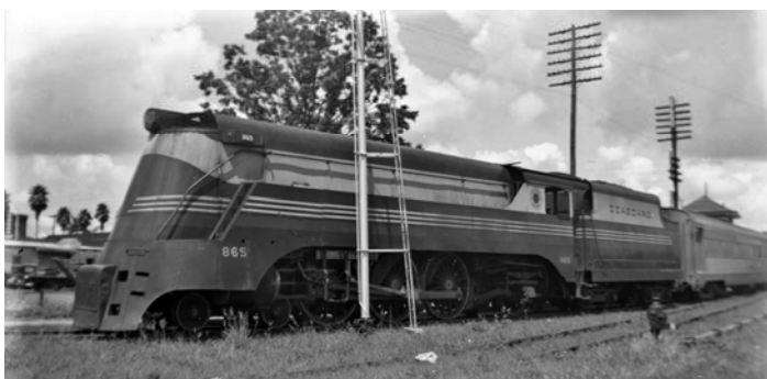
Here is more action at Plant City with SAL #865 P class 4-6-2 Streamlined Pacific stopped at Union Station with the Silver Meteor. The train is across the diamond of the ACL main line and the locomotive is beginning its curve to the west to continue its short run to Tampa Union Station. The SAL streamlined three of these Pacifics to handle the expanded west coast Meteor service from Wildwood due to the backlog of diesel orders.