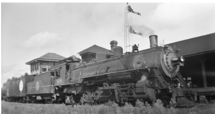
This photo, also from the early 1940s, captures sister ACL #810 M-S class extra crossing the SAL diamond east bound (RR north) in Plant City. The SAL tracks cross between the two towers and the tower farthest away was on the top of Plant City Union Station and was later removed. The closest tower was moved across the tracks to the north side of Union Station.