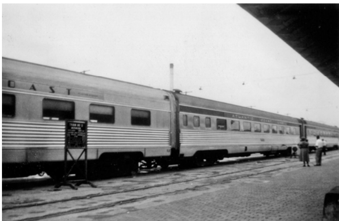
ACL's all Pullman Miamian , train 8, was at FEC's Miami depot in 1941, preparing for its departure to New York City. FEC and ACL cars can be seen mixed in the consist. FEC, RF&P and PRR contributed cars to the consist in proportion to their main line miles of the total trip.