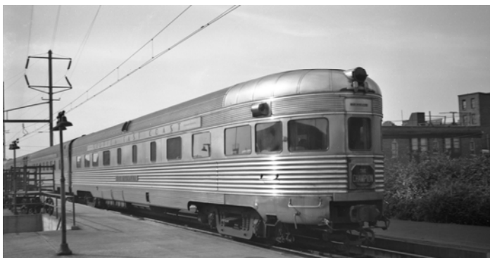
ACL's Champion with FEC round-end, tavern-observation Biscayne Bay bringing up the markers, was running under the wires on the Northeast Corridor, and no doubt, there is a Pennsy GG-1 on the point. What class!! This car was purchased by the SAL after the FEC strike and became their 6607.