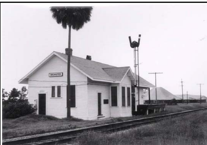
Brewster, FL Depot.