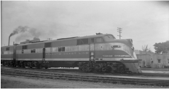
ACL's coach-Pullman Champion from New York City, with E3A 500 on the point, was on the FEC in Miami in 1941. All ACL Miami bound trains ran over the FEC from Jacksonville until the FEC strike of 1963. The locomotive was from the West Coast Tamiami Champion but was leading the East Coast Champion . This illustrates why train names were soon deleted from the locomotives. In 1949 the Champion was officially renamed the East Coast Champion .

This monthly photo column by Ken Murdock features railroad scenes of the past, a look back into railroading's history.