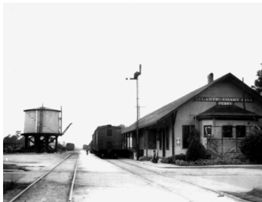
This is ACL's Perry depot where their famous Southland made its first Florida stop on its run from Chicago and the Midwest to Florida's West Coast. The Perry stop was mainly to serve the nearby winter resort at Hampton Springs. Once the Perry Cut-off was completed in 1927, this new route bypassed Jacksonville, saving 92 miles, and made the Southland the fastest train from the Midwest to Florida's West Coast. Perry was known as the Gateway to Florida's West Coast.