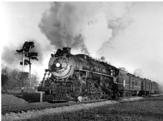
The southbound Southland, train 33, is accelerating as it leaves Perry several hours late, which afforded this rare opportunity to photograph it in Perry on this cool March morning in 1946. Engine 1405, class J-1, was one of five former Delaware Lackawanna & Western 4-8-2 locomotives purchased by the ACL, and were used almost exclusively on the Southland between Albany, Georgia to Tampa. They were all scrapped on 1951 and 1952.