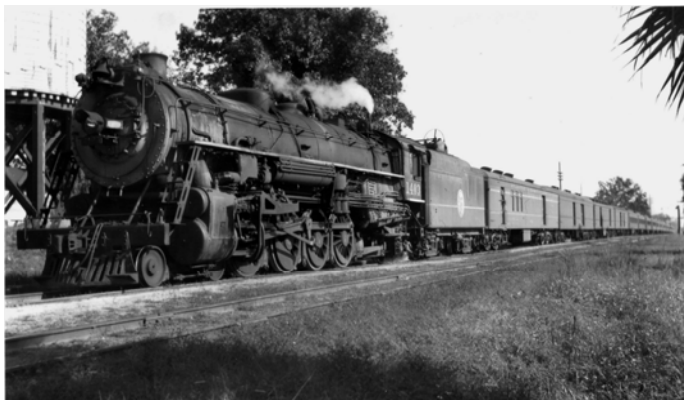
It's October 21, 1945 and the south bound Southland , train 33 with engine 1403, a 4-8-2, was captured making a water stop in Dunnellon. The consist was all heavyweight cars with an RPO behind the tender and three baggage/express cars following. This once popular train succumbed to the automobile and air travel and made its last run on November 29, 1957. The Perry cut-off tracks began to be removed in 1990.