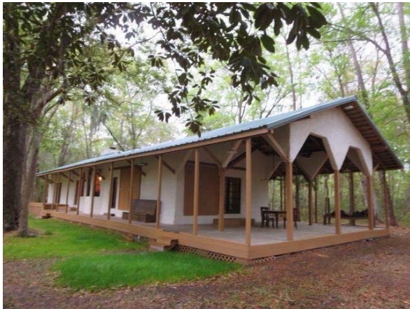
The former ACL RR Longwood, FL depot in its Current configuration as a residence in Hilliard, FL